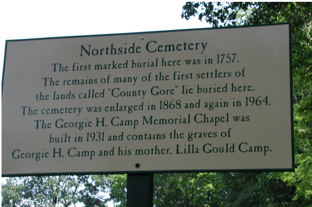
Northside Cemetery - Site of Many Wheelock Burials