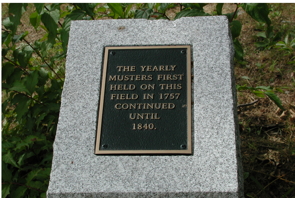
Training Exercises Were Held Every Year