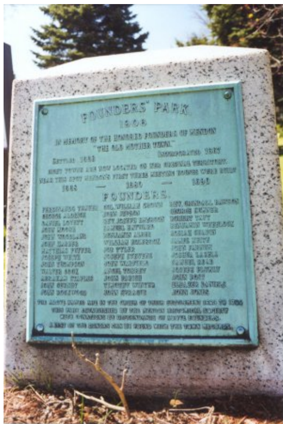
Founders Monument in the Center of Mendon, MA

This genealogy is a snapshot of a work in progress. It was begun in 1997, and has drawn heavily from contributions many people have made to The Wheelock Family Genealogy website at www.WheelockGenealogy.com . This website has drawn readers and contributors from all over the world, including the United States, Canada, England, Africa, Germany, and Uzbekistan. It has provided a means to disseminate information about the Wheelock Family, and to draw corrections and criticisms from many sources; and as a result has greatly facilitated the evolution and growth of the Wheelock Family tree.