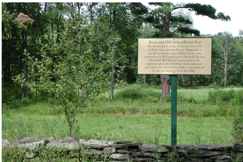
Site of the Old Red School Where Many Members of the Wheelock Family Were Probably Students