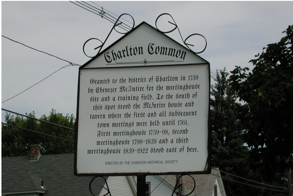
Charlton Common - Site of the Original Meeting House