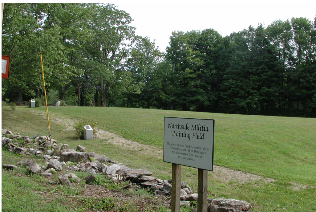
Northside Militia Training Field, Across from Rider Tavern