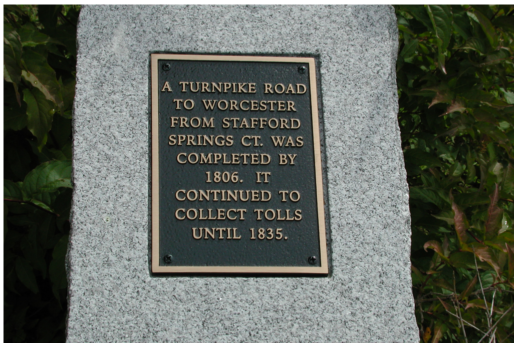
Travelers on the Stafford Road Provided Ready Customers to the Rider Tavern