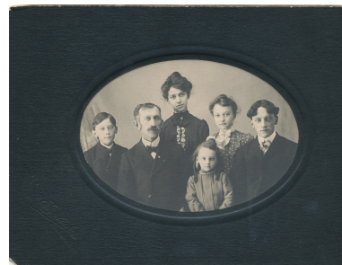
Millard Fillmore Wheelock With Children